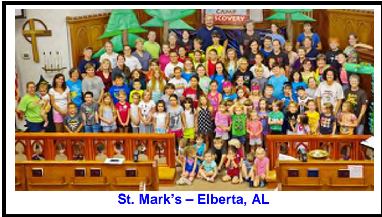
St. Mark's – Elberta, AL