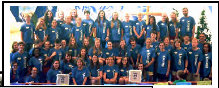
Lutheran Church of Vestavia Hills, AL